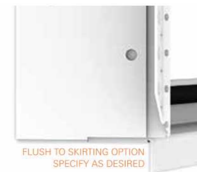
FLUSH TO SKIRTING OPTION SPECIFY AS DESIRED