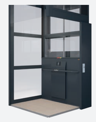
Shaft: Powder coated in RAL 7021, clear glass Back panel: Powder coated in RAL 7021 Front panel: Powder coated in RAL 7021 Handrail & top safety edge: Powder coated in RAL 7021 Floor: Surestep Material Grey Seagrass.