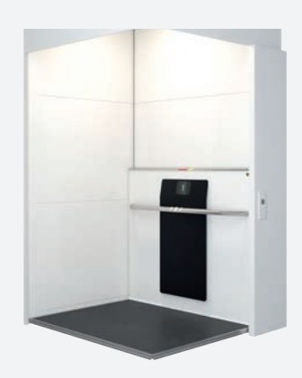
Shaft: Standard white steel panels Back panel: Powder coated in RAL 9016 Front panel: Powder coated in RAL 9005 Handrail & top safety edge: Natural, anodised aluminium Floor: Standard floor Altro Contrax, black.

Mix and match different colours for great contrast or go for a monochrome lift design to create calm and harmony.