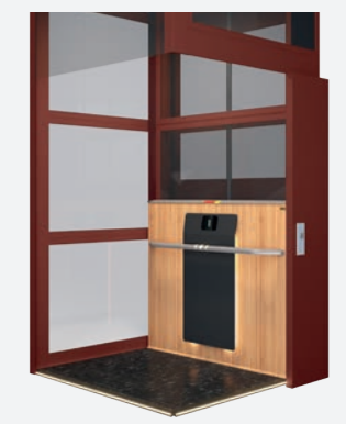
Shaft: Powder coated in Alesta Amethyst 2, tinted glass Back panel: Bamboo Front panel: Black DecoLegno Piombo HM07 Handrail & top safety edge: Natural anodised aluminium Floor: Customised tiles.