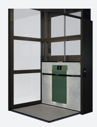
Shaft: Powder coated in RAL 8022, clear glass Back panel: Grey wool Front panel: Powder coated in RAL 6020 Handrail & top safety edge: Powder coated in RAL 9005 Floor: Surestep Material Black Seagrass.