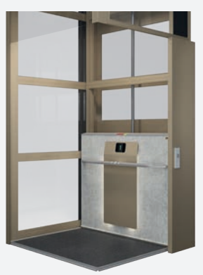
Shaft: Powder coated in Roman Gold, clear glass Back panel: Grey wool Front panel: Powder coated in Roman Gold Handrail & top safety edge: Natural anodised aluminium Floor: Standard floor Altro Contrax, black.