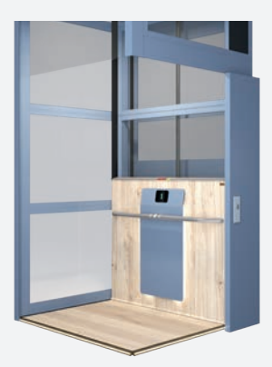
Shaft: Powder coated in RAL 5014, tinted glass Back panel: Oak Front panel: Powder coated in RAL 5014 Handrail & top safety edge: Natural anodised aluminium Floor: Customised wood laminate floor.

Enhance the beauty of your home by combining different colours and textures with your favorite grain of wood.