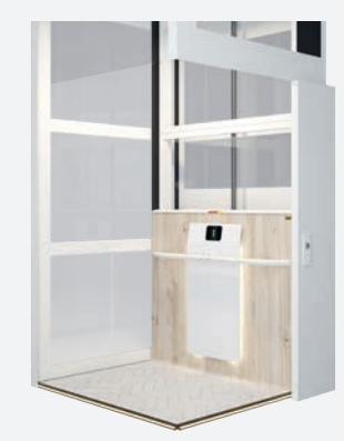
Shaft: Powder coated in RAL 9016, clear glass Back panel: Oak Front panel: White DecoLegno Piombo HM00 Handrail & top safety edge: Powder coated in RAL 9016 Floor: Customised tiles.