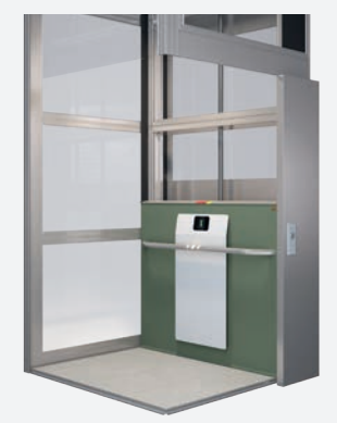
Shaft: Natural, anodised aluminium, clear glass Back panel: Powder coated in RAL 9016 Front panel: Powder coated in RAL 7004 Handrail & top safety edge: Natural, anodised aluminium Floor: Surestep Material Quartz Stone