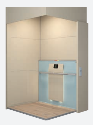
Shaft: Steel panels powder coated in RAL 1019 Back panel: Light blue linen Front panel: Powder coated in RAL 1019 Handrail & top safety edge: Natural anodised aluminium Floor: Customised wood laminate floor.

Combine the rich textures of wool and linen with different colours to add softness and elegance to your interior design.