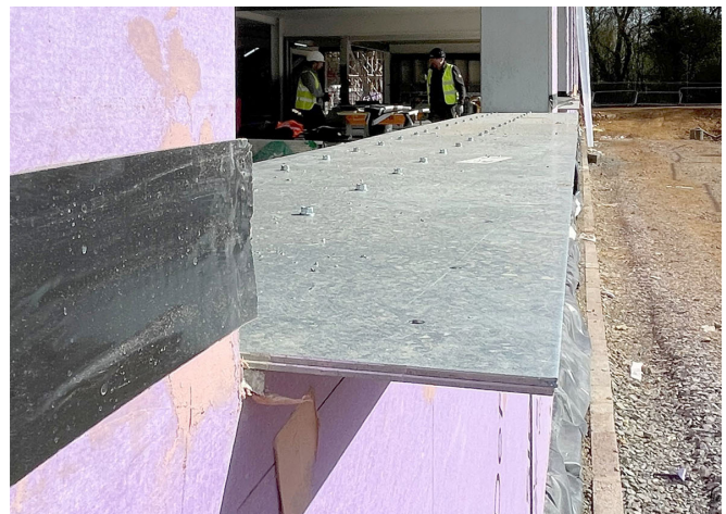
Reinforced cill brackets to take point loads

Openings in external wall panels are required at window and door locations. Additional members are required to frame around openings: jambs either side of the opening; a lintel above the opening; and a cill below the opening. Additional hot rolled steel sections may be required around larger openings such as ribbon windows and bay doors.