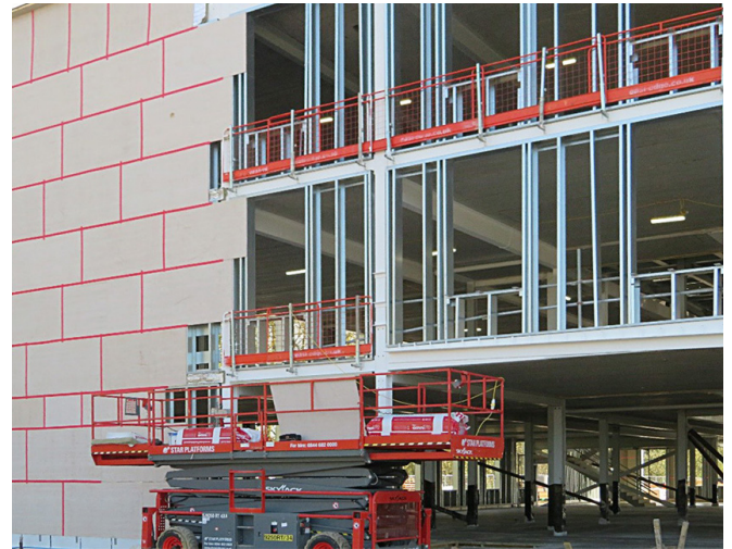
Cement boards on stick-built infill

Ensure that the warranty companies are involved in approving the specification, adopting PAS 670 magnesium oxide-based boards for use in buildings.