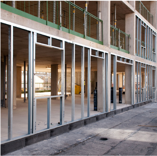
SFS base construction

The framework is usually positioned within the confines of the structure. In some cases, however, the panels may be constructed such that they project past the edge of the primary structure to a nominal overhang, by cantilevering or using brackets or supplementary framework.