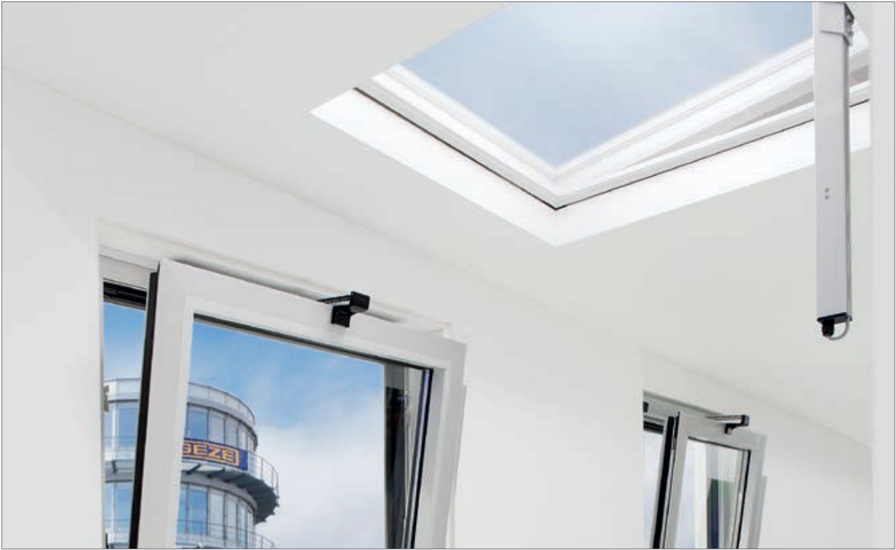
GEZE Slimchain and GEZE E 250 NT