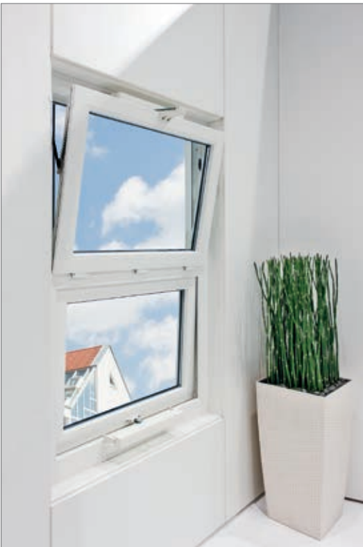
GEZE ECchain with safety scissors