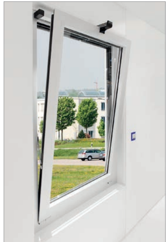
GEZE Powerchain with safety scissors