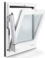
Opening and locking systems