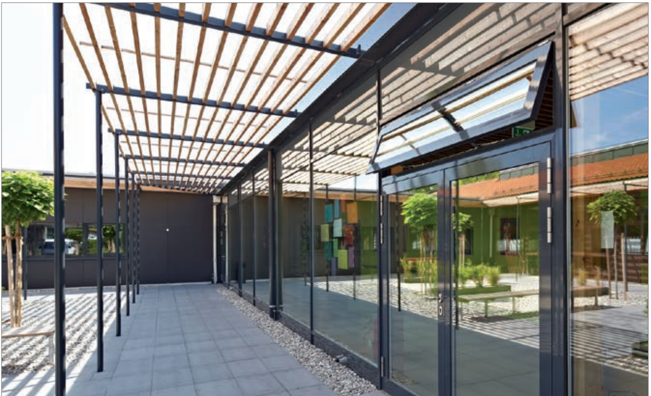
GEZE OL 90 top-hung, outward opening, Stiftung Ecksberg, Mühlendorf, Germany