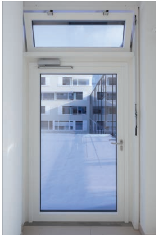
GEZE TS 5000 and OL 90 N with post-rail transmission, Nursing home Augustinum, Stuttgart, Germany