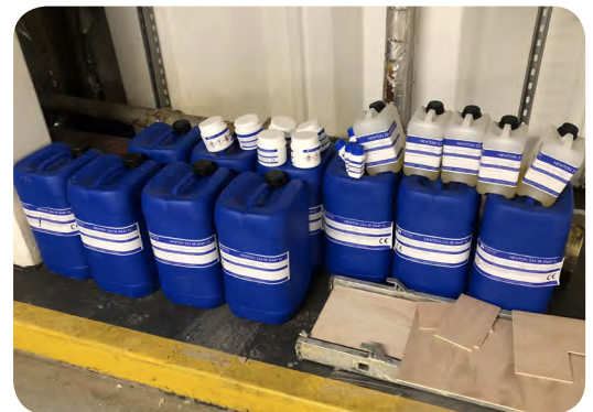
6. Using the Newton 324-SR resin, ASF Waterproofing were able to get the job done quickly and efficiently.