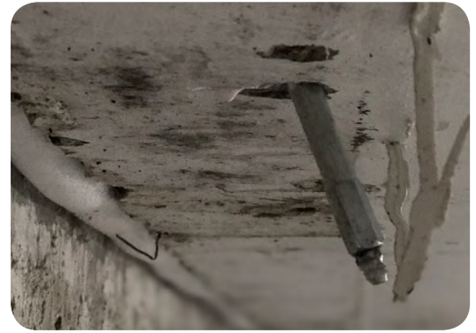
3. The movement joint is filled with a foam backing rod and the packer is inserted behind ready to inject

Newton recommends that our structural waterproofing systems are installed by one of our nationwide network of Newton Specialist Basement Contractors (NSBC) . Trained by Newton, NSBCs offer full professional indemnity on design, and insurance backed guarantees on the installation.