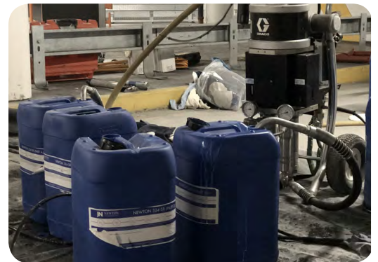
4. Newton 324-SR resin, ready to inject using the two-component stainless steel pump