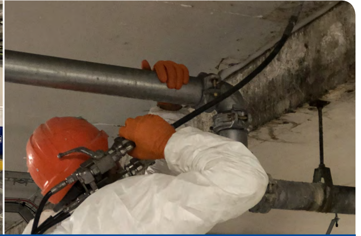
Sealing Movement Joints in a With Concrete Injection Resin