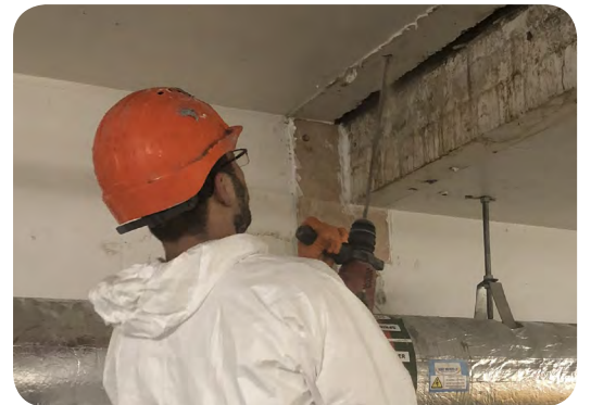
2. Drilling a hole for a 10mm injection packer above the movement joint that needed sealing