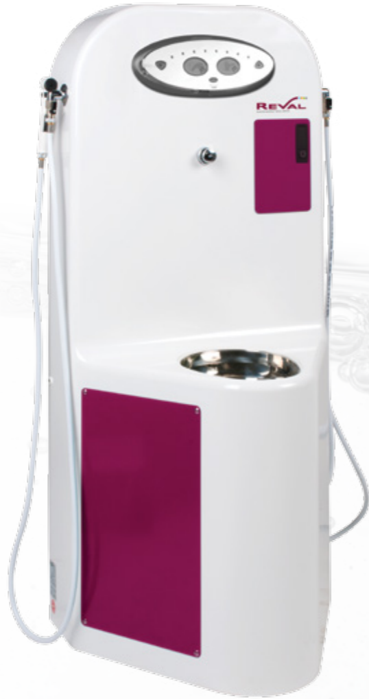
Shower, Disinfection & Sluice System 3012.01