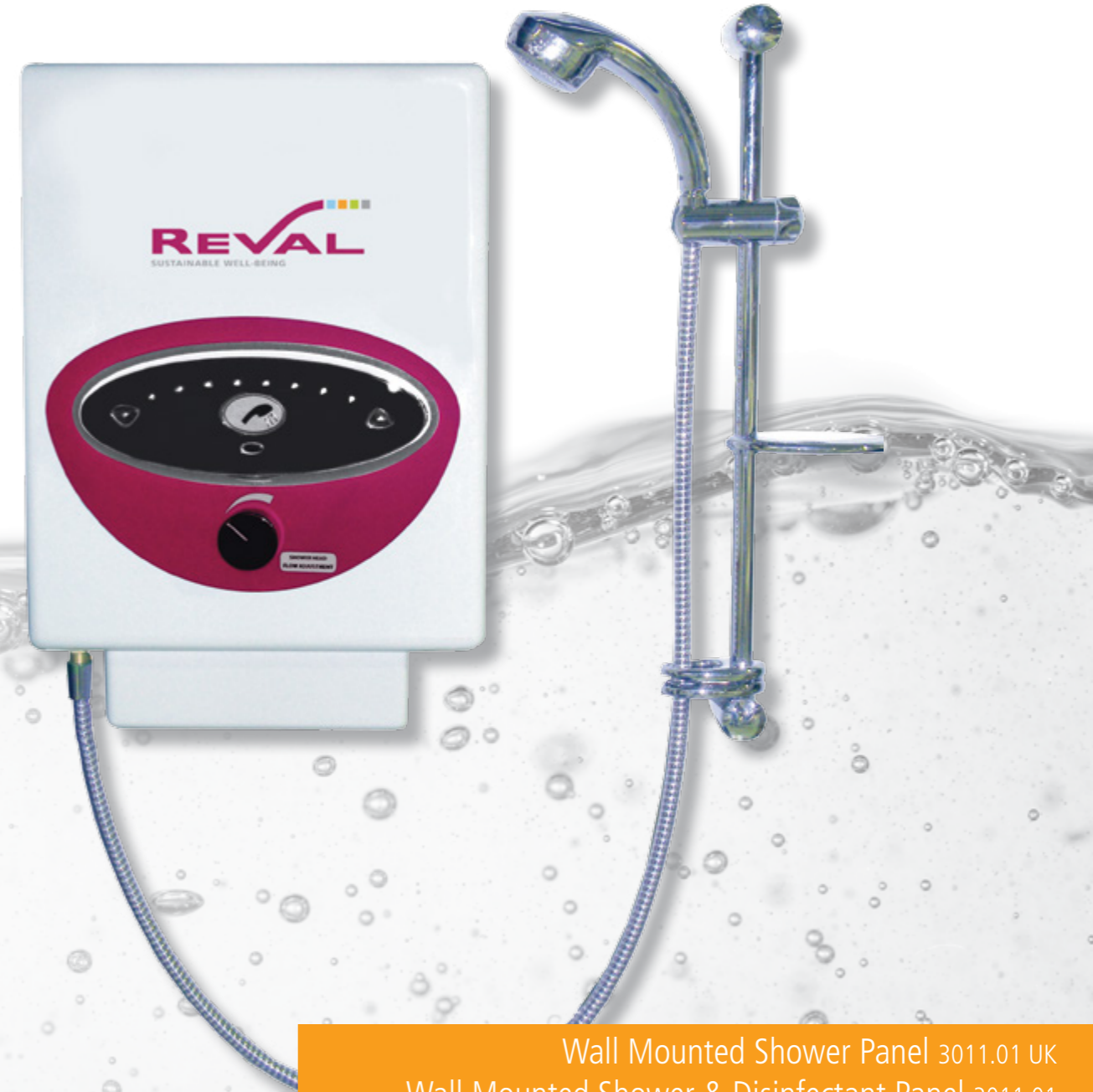
Wall Mounted Shower Panel 3011.01 UK Wall Mounted Shower & Disinfectant Panel 3011.01

Our Opale hygiene panels provide two key functions. The thermostatic patient shower provides clean safe thermostatically controlled water to shower and wash a patient, ensuring effective hygiene. The second function is the auto disinfection system used to clean and disinfect the equipment after patient use. Our Opale hygiene panel is the perfect solution for wet room environments and alike.