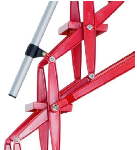
Supreme heavy-duty aluminium loft ladder with optional red powder coat finish