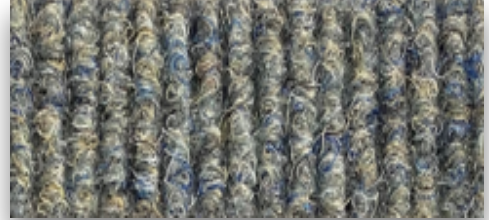
Shadow (Light Grey)