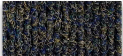
Majolica (Blue/ Green)