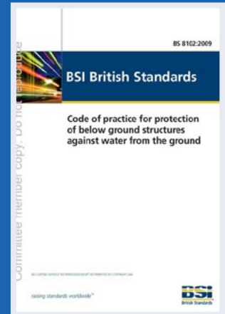
BS8102 'Code of Practice for Protection of Below Ground Structures Against Water From the Ground'

Newton provide waterproofing products for all 3 types of waterproofing defined within BS8102