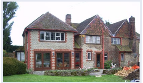
The owners of this stylish property wanted more space and created a new basement

The NSBC installed Newton System 500 with no minimal surface preparation and in a timely manner without the need for extensive drying out times as with other internal tanking systems. The system was installed with service entry points into the drainage channel to enable maintenance of the system - a new design requirement under BS8102:2009.