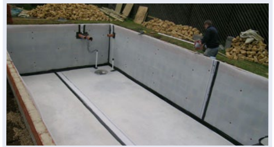
Newton 508 cavity drain membrane was applied to the walls