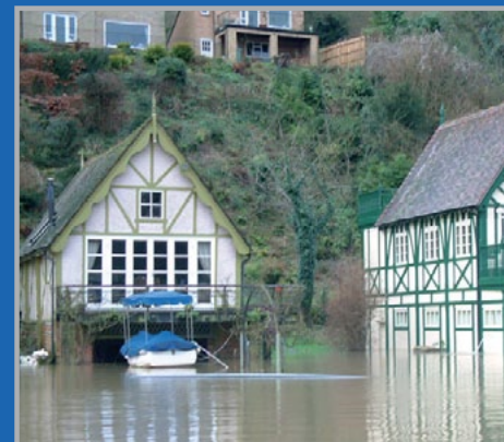
Newton System 500 is installed in this incredible property, it works by redirecting the water rather than attempting to hold it back