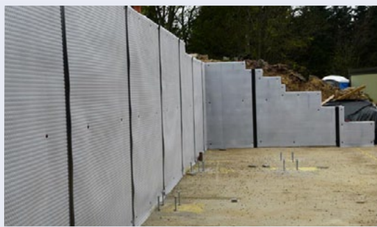
Newton 508 cavity drain membrane was applied to the walls