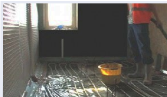
Application of Newton 508 cavity drain membrane to the walls