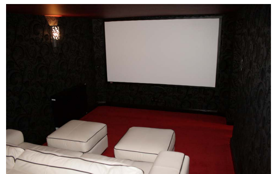
... and house the top spec home cinema system