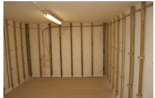
Newton 508 fixed to all retaining walls