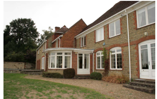
Stunning Grade II listed property