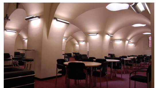
Project complete - Bar and rest area open for business!