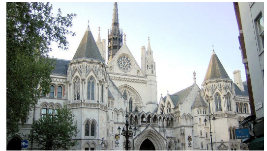
Royal Courts of Justice - Aldwych, London