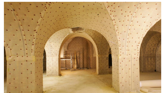
Completion of fixing of Newton 508 Mesh