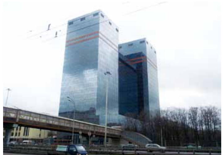
The Skylight complex in Moscow.

The raised flooring contract was awarded by KMT Construction