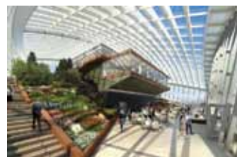
Above and far left: Computer generated images of how the building will make its mark on the London skyline.